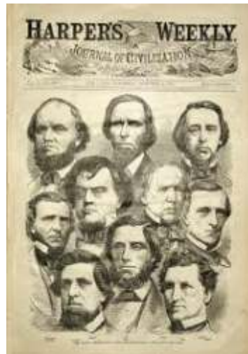
Front Page News--Georgia Secedes

The program will be the reenactment of the speeches by 5 of the main speakers at the 1861 Convention-- Alexander .S Stephens, Robert Toombs, Thomas Cobb, Eugenius Nisbett, and Hershel Johnson--and focuses on the issues each representative brought to the debate. The performance will last 30-40 minutes and will end with a very dramatic conclusion.